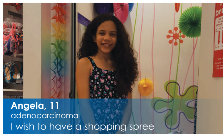
Angela, 11 adenocarcinoma I wish to have a shopping spree