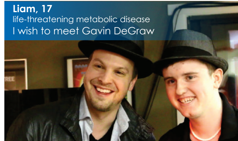
Liam, 17 life-threatening metabolic disease I wish to meet Gavin DeGraw